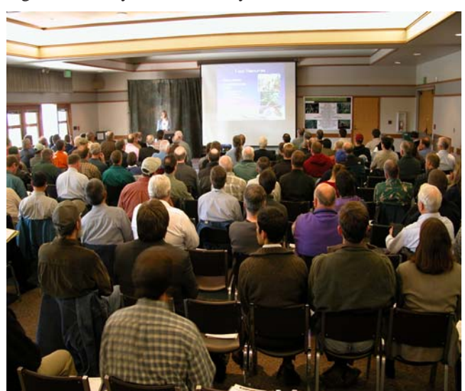
More than 170 people from the U.S. and Canada attended the International Alder Symposium at the University of Washington March 23-25, 2005.

Once considered a weed, red alder is increasingly recognized as a premium commercial species unique to the Pacific Northwest. This tree species has proven to be a renewable resource that when manufactured into high quality products can be an attractive and affordable alternative to exotic hardwoods from endangered tropical rainforests. The rising price of alder logs is testimony to the market's recognition of its product value. Scientists now know that alder also provides very important contributions to the health of forest ecosystems by contributing nitrogen to soils and organic matter to streams. It is no wonder that forest managers now regard alder in a new light. Yet regional changes that are affecting red alder management and utilization, including advances in our understanding of ecology and silviculture, market and nonmarket values, and the management implications of current regulations may not be broadly understood.